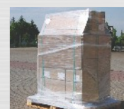
WOODEN AND PLASTIC PALLETES AVAILABLE

Pallet sizes are: 1200 x 800 mm (47.2441 x 31.4961 in), 1000 x 1000 mm (39.3701 x 39.3701 in), 1250 x 990 mm (49.2126 x 38.9764 in) or according to your design. Quantity per pallet: between 500 kg to 1056 kg (1102 to 2328 lb) or according to your requirements.