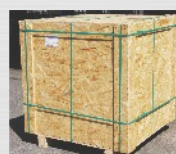
NO NAIL BOXES

Size of the wooden box: 1100 x 1130 x 1116 mm (43.3071 x 44.4882 x 43.9370 in). Quantity per wooden box: 648 kg (1428 lb). We are able to put 20 wooden boxes in one 20" container. This is a total quantity of 12960 kg (28573 lb). All wooden packaging is heat treated.